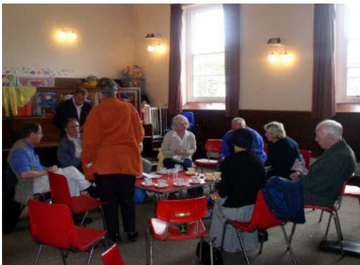
Our "picnic" Lunch in the pleasant surroundings of the Neath Meeting House.

Unfortunately, the weather was rather wet and it was decided that we should eat our picnic lunch in the Meeting House and then proceed on our walk. The feasting over, and numbering about fifteen altogether, we set out on our walk. Contd below