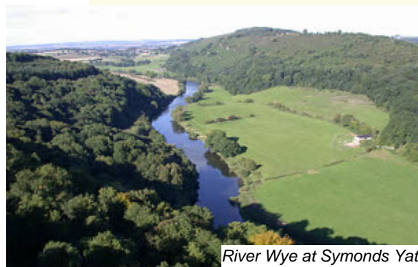
River Wye at Symonds Yat

In a fairly small area, there are numerous places of interest, what with castles, hills, (with viewpoints), churches, villages. There are not many visitors. I should add that one of the attractions of the area that Newport (my home town) is still at the centre of my "mental map", and I still see the above-named places as